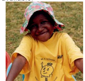
Nyumbani

The first disbursement, made in May, was granted to St. Vincent's Chara House in Baltimore. Chara House is a community based transitional home for infants and toddlers from birth to four years of age. The children that reside in the house have medical and developmental challenges such as prenatal drug exposure and HIV/AIDS. The Chara House staff provides a nurturing and therapeutic home-like environment that serves to stabilize and enhance the lives of the children. To support these efforts, MSMF contributed $2,000 to help purchase two key pieces of clinical equipment that will provide the children with some of the best care available.